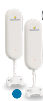
WATER LEAK DETECTORS - Battery operated