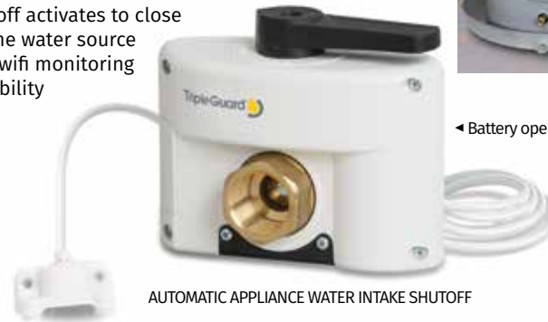
◀ Battery operated