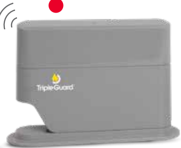
HUB LINK - to cloud server.