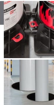
CID Alignment connectors allow tight placement of multiple penetrations.