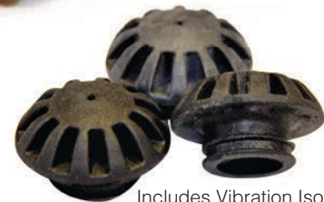
Includes Vibration Isolators